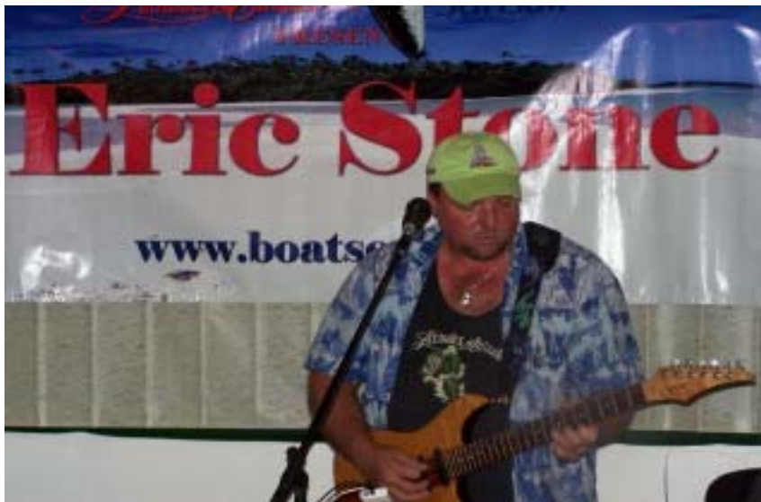
The Jimmy Buffet Dinner Dance was a TOTAL success with raffle prizes setting the tone! See www.bbvc.org/photos.html for more pics and a list of DONORS.